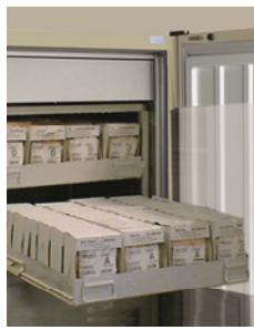
Custom made drawers upon request