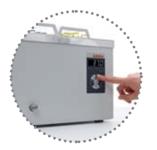
Ease of use.

The controls on the front side are easy to reach and use.