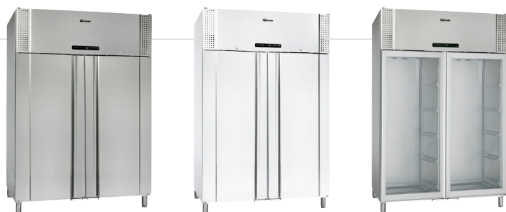
The BioPlus 1270/1400 is available as a refrigerator or freezer in either white or stainless steel finish. All BioPlus models come with self-closing door. Glass door is available for refrigerator.

In terms of performance, these units are designed to provide the very best results even under exceptional conditions. The BioPlus utilises environmentally responsible HFC-free foam propellants and is available with HFC-free refrigerants.