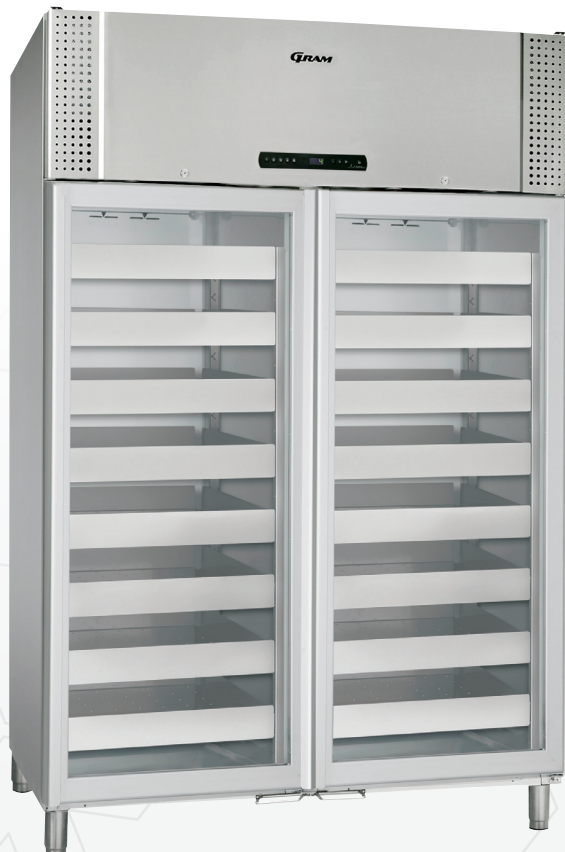
BioPlus 1400. Drawers and glass doors are optional extras.

The BioPlus 1270/1400 range is designed for the storage of the most delicate biomaterials, in situations where even tiny fluctuations in conditions inside the storage cabinet can have a serious effect on the contents.