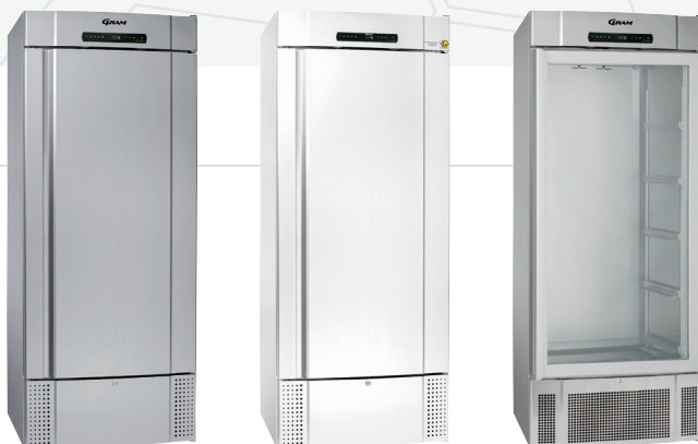
The BioMidi 625 is available as a refrigerator or freezer in either white, aluminium or stainless steel finish. All BioMidi models come with selfclosing door. Glassdoor is available for refrigerator.