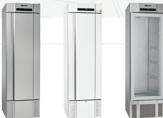
The BioMidi 425 is available as a refrigerator or freezer in either white, aluminium or stainless steel finish. All BioMidi models come with selfclosing door. Glassdoor is available for refrigerator.