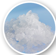
FM-8oKE-HC Ice: Flake