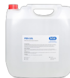
PDS-10L BS-040107-FK DNA/RNA Decontamination Solution 10l