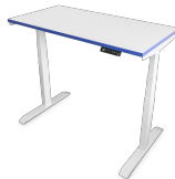
LT-120 BS-040107-EK Height adjustable desk