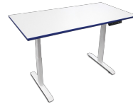
LT-150 BS-040107-JK Height adjustable desk