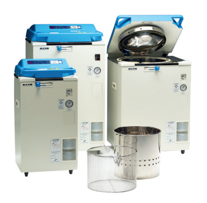
The HV family Classic autoclaves