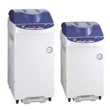
The HG family Premium autoclaves

Advanced functionality with many configuration options for a wide range of applications