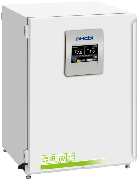
MCO-171AICD / MCO-171AICUVD