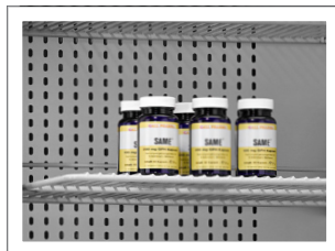
Optimized air guide plate The optimized air guide plate reduces temperature deviations inside the system to a minimum.