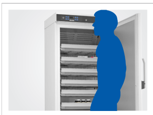
Display at eye-level The display is positioned at eye-level to make it easier to read and simplify operation.