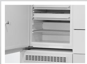
Standalone or undercounter installation with a large interior.