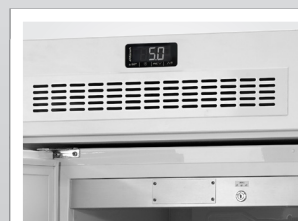
User friendly with automatic defrosting and electronic temperature controller that can be installed into furniture front.