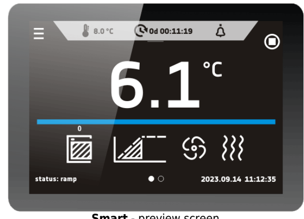
Smart - preview screen