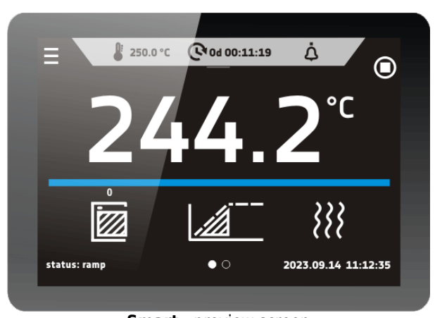
Smart - preview screen