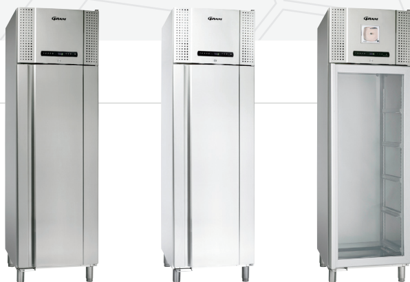
The BioBlood 500 is available as a refrigerator or freezer in either white or stainless steel finish. All BioBlood models come with selfclosing door. Glassdoor is available for refrigerator.

The BioBlood 500 utilises environmentally responsible HFC-free foam propellants and is available with HFC-free refrigerants.