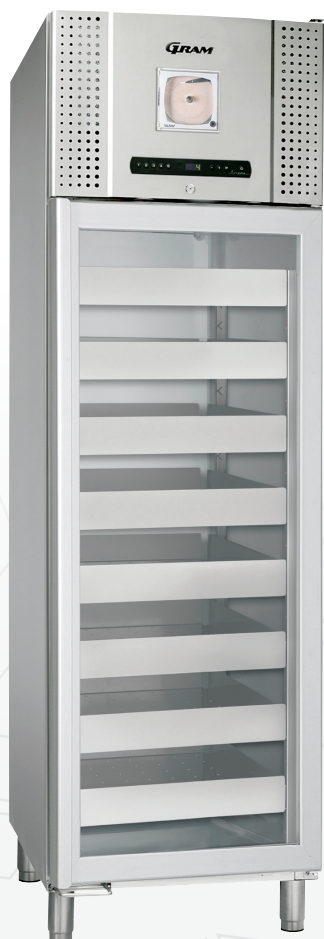
BioBlood BR500. Drawers and chart recorder are optional extras.

The BioBlood 500 design is customised to meet the special requirements associated with the controlled storage of blood, plasma and blood-related products.