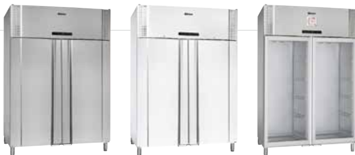
The BioBlood 1270/1400 is available as a refrigerator or freezer in either white or stainless steel finish. All BioBlood models come with selfclosing door. Glassdoor is available for refrigerator.

The BioBlood 1270/1400 utilises environmentally responsible HFC-free foam propellants and is available with HFC-free refrigerants.