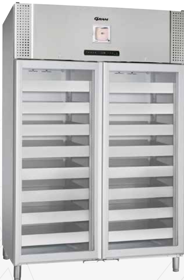
BioBlood BR1400. Drawers and chart recorder are optional extras.

The BioBlood 1270/1400 design is customised to meet the special requirements associated with the controlled storage of blood, plasma and blood-related products.