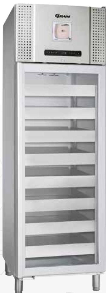
BioBlood BR660D. Drawers and chart recorder are optional extras.

The BioBlood 600/660 design is customised to meet the special requirements associated with the controlled storage of blood, plasma and blood-related products.