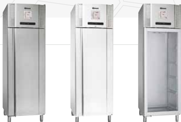
The BioBlood 600/660D is available as a refrigerator or freezer in either white or stainless steel finish. All BioBlood models come with selfclosing door. Glassdoor is available for refrigerator.

The BioBlood 600/600D cabinet utilises environmentally responsible HFC-free foam propellants and is available with HFC-free refrigerants.