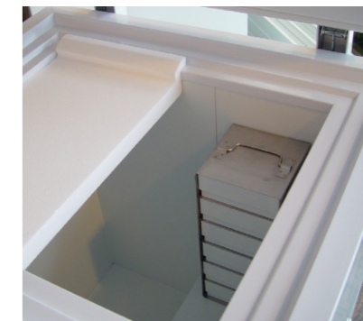
Inner lids (left hand side) which are mandatory for optimized function