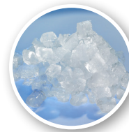
FM-8oKE-HCN Ice: Nugget