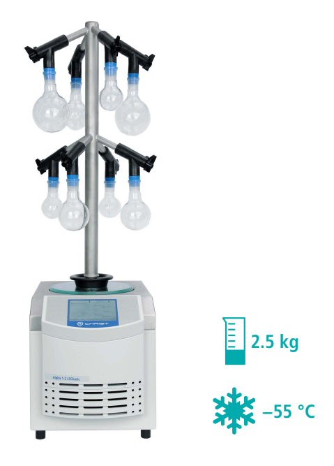
Alpha 1-2 LSCbasic