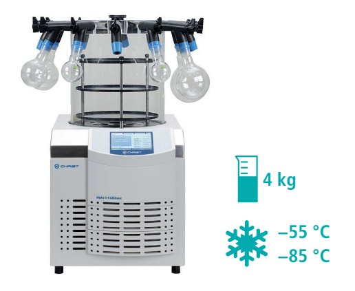
Alpha 1-4 LSCbasic Alpha 2-4 LSCbasic