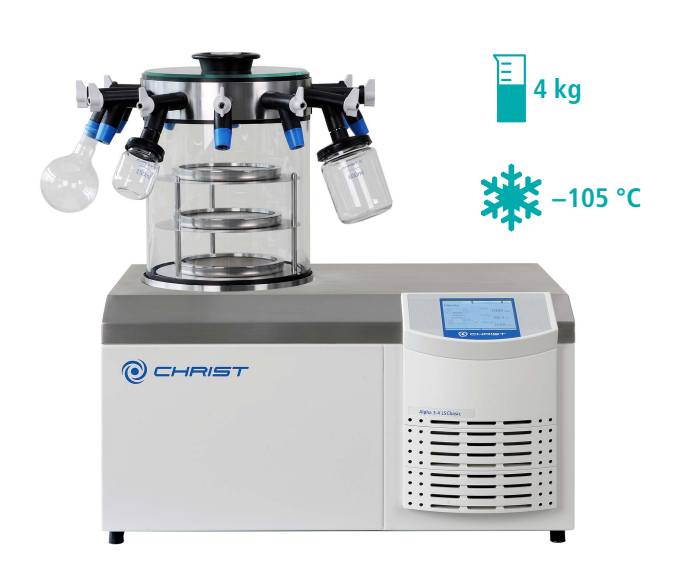
Alpha 3-4 LSCbasic