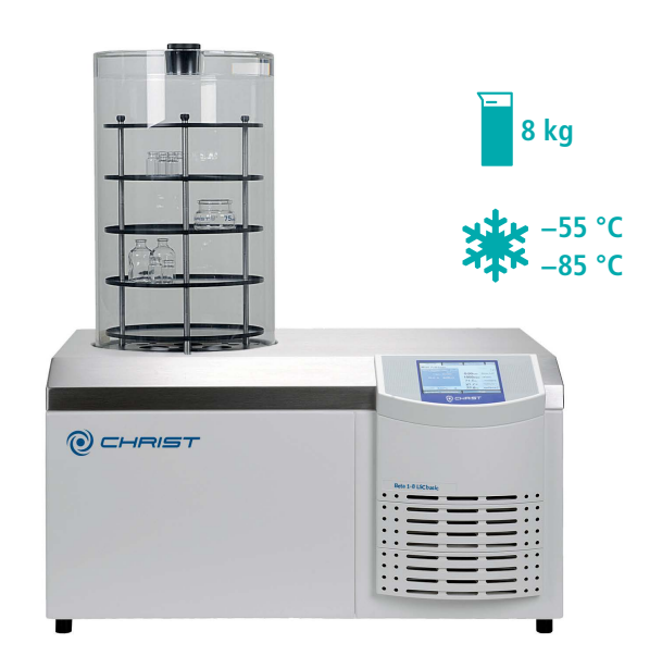
Beta 1-8 LSCbasic Beta 2-8 LSCbasic